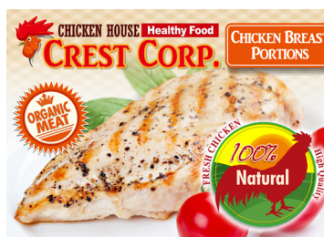
Food and beverage label